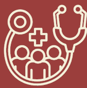
Health & Social Care